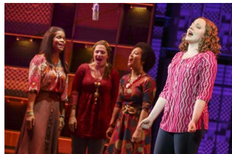
Beautiful: The Carole King Musical

The inspiring true story of King's remarkable rise to stardom, from being part of a hit songwriting team with her husband Gerry Goffin, to her relationship with fellow writers and best friends Cynthia Weil and Barry Mann, to becoming one of the most successful solo acts in popular music history. Along the way, she made more than beautiful music, she wrote the soundtrack to a generation.