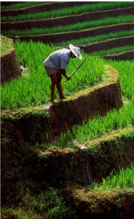
Mandapa rice terrace

The Reserve is an hour drive from Bali Ngurah Rai International Airport, and close to Gaya Art Space, Neka Art Museum, Blanco Museum, Ubud Market and Puri Lukisan Museum.