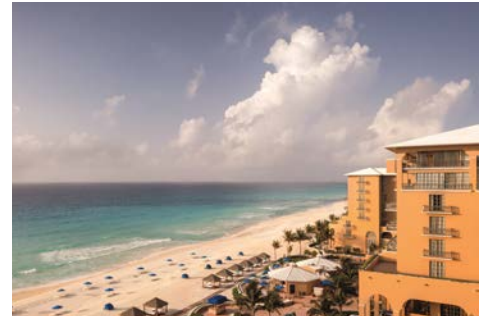
The Ritz-Carlton, Cancun

Offer is valid June 17, 2016 through December 22, 2016 and includes participation in one cooking class for two Destination Club Members. Requires at least 24-hour advance booking. Rate is per room/per night, based on single or double occupancy, exclusive of taxes, gratuities, fees and other charges; does not apply to groups; cannot be combined with any other offer and is not applicable for Rewards redemption. No refund or credit for unused portion. Void where prohibited.