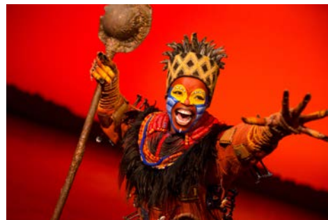
The Lion King

* Discounts not available for all performances. Extent of discount amount depends on day of the week and section within the theatre. Ticket price includes facility fee and per ticket fee. Tickets subject to availability. Other restrictions may apply.