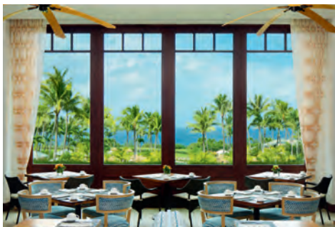
The Ritz-Carlton, Kapalua