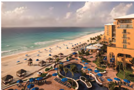
The Ritz-Carlton, Cancun