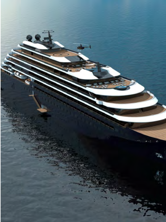
The Ritz-Carlton Yacht Collection

In 2019, The Ritz-Carlton will become the first luxury hotel brand to offer bespoke yacht experiences through its custom-built luxury yacht collection, bringing the iconic Ritz-Carlton service and timeless style to unique, distinguished seafaring destinations around the world. Named The Ritz-Carlton Yacht Collection, the first of three lavish cruising yachts in this series is scheduled to take to sea in the fall of 2019.